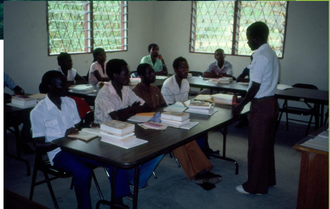
School of nursing classroom